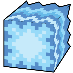
This is what your assembled HADOKEN! Paper Foldable should look like.